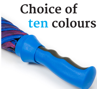
Standard plastic pistol grip handle with black finger grips

ProBrella FG Mini Vented umbrellas are available with a black and navy pole only but with a choice of ten colours for handles and ferrules.